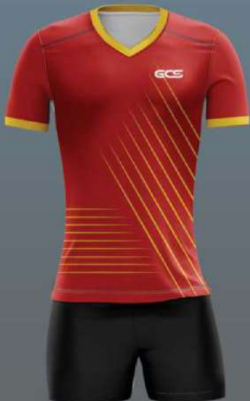
CYAN ROYAL WHITE