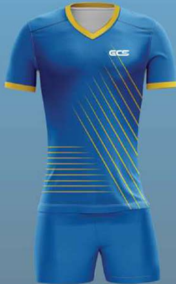
RED NAVY WHITE