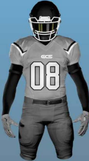
GREY WHITE & BLACK