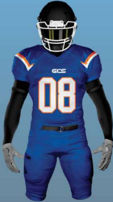
ROYAL WHITE & ORANGE