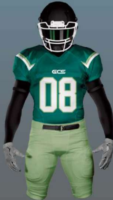
PETROL WHITE & LIGHT GREEN