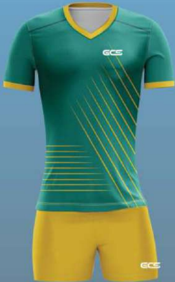
TURKESH MINT GREEN