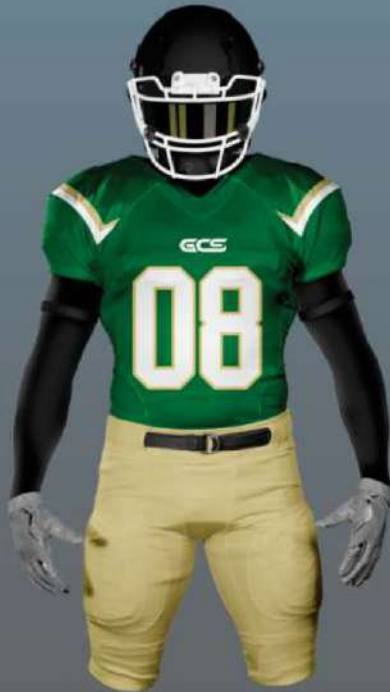
GREEN WHITE & CREAM