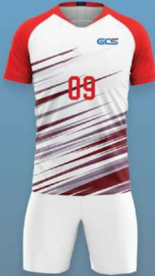
RED WHITE DARK RED