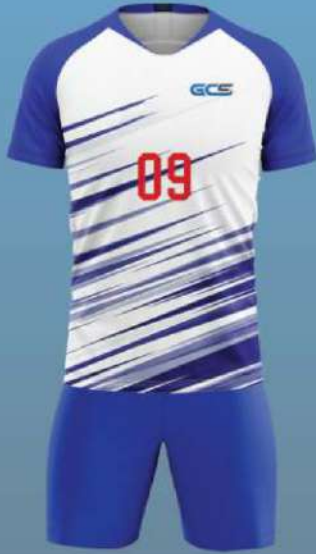
ROYAL WHITE NAVY